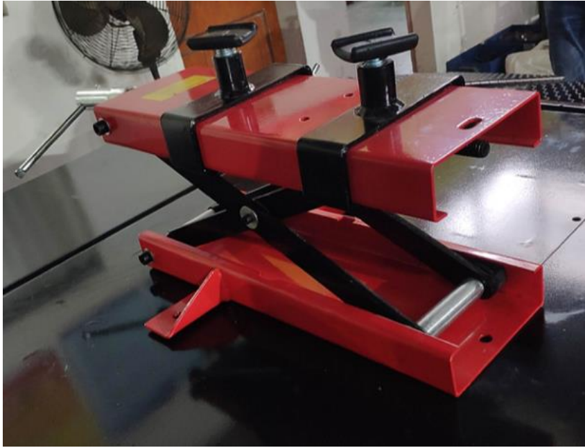
Motorcycle lifting jack, comes standard with each lift