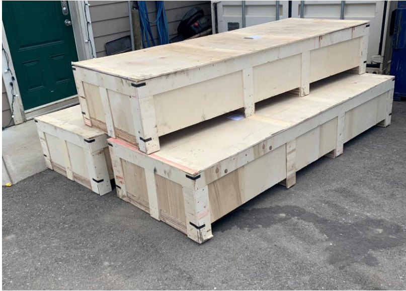
Motorcycle/ATV lifts as shipped