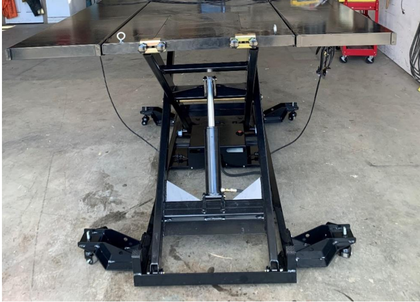
Easy rolling, swivelling wheels on a wide, stable base.