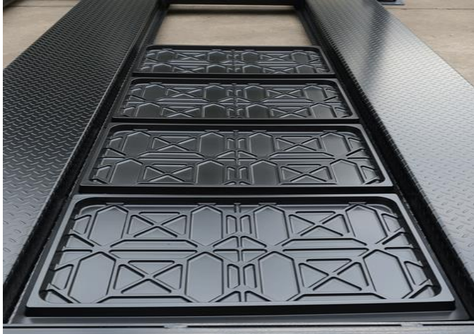
Drip Trays x 4