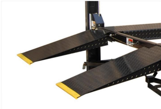
Drive-on ramps with anti-scratch and high visibility edge