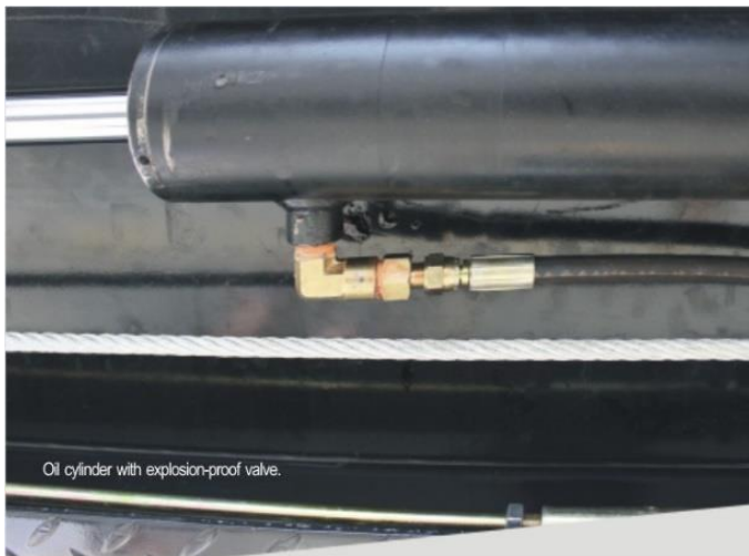
Cylinder with explosion-proof valve