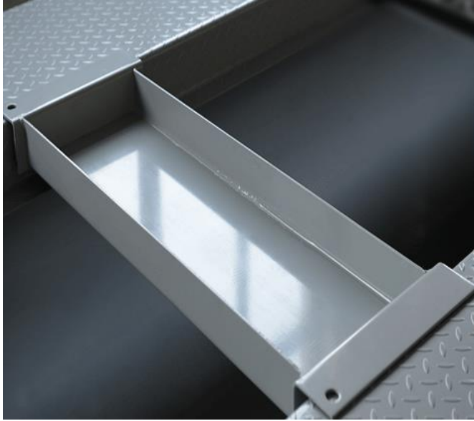
Sliding Tool/jack tray