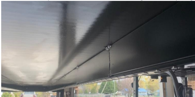
Welded-on Steel doubling for extra strength