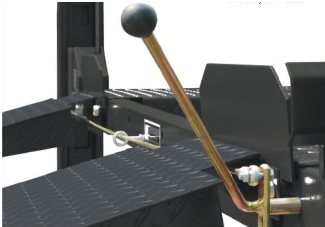
Heavy-duty Release Mechanism and Runway Wheel Stoppers