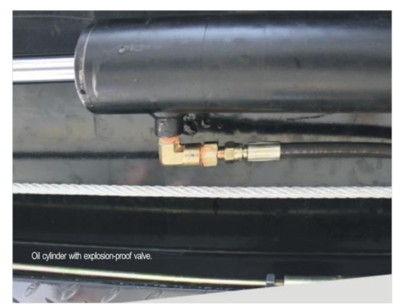
Cylinder with explosion-proof valve