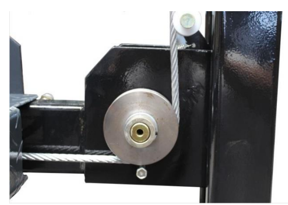
Pulleys and Cables