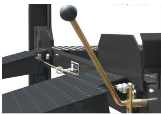
Heavy Duty Release Mechanism and Runway stoppers