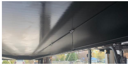
Welded on Steel doubling for extra strength