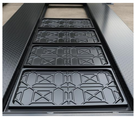
Drip Trays x 6