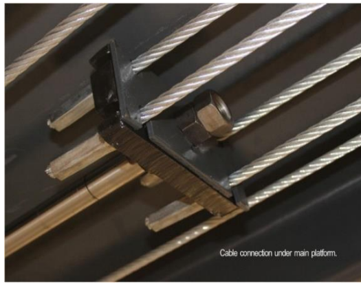
Connections under runway