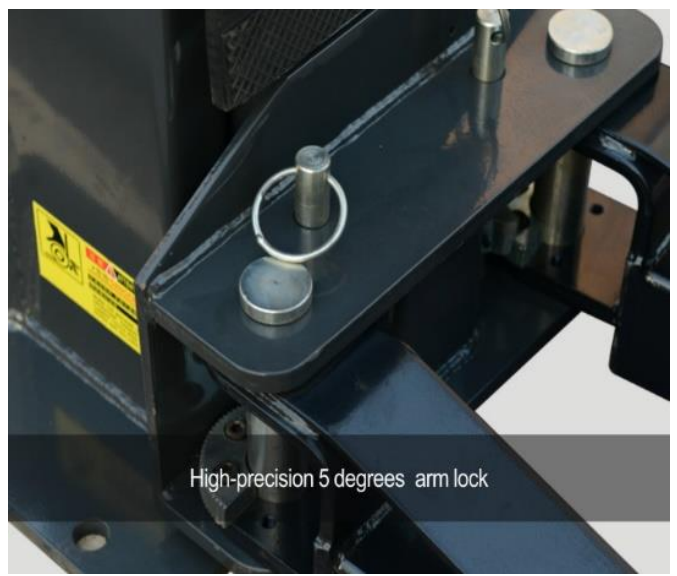
High precision 5 degree arm lock