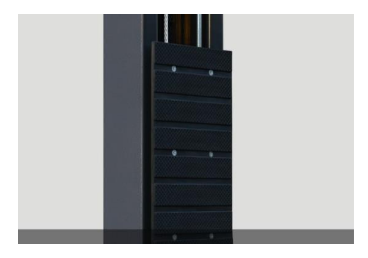
Rubber, protective door bumper