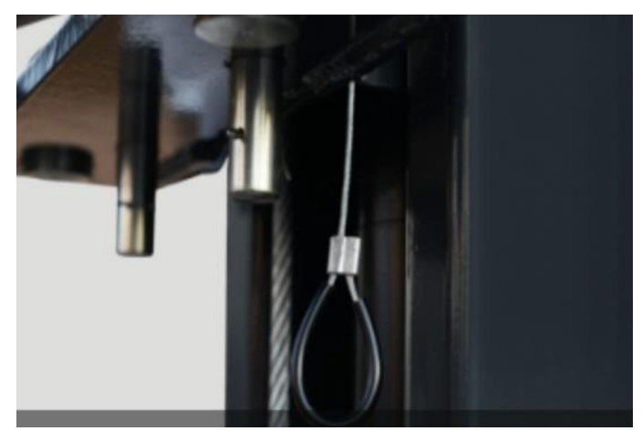
Bilateral, manual lock release