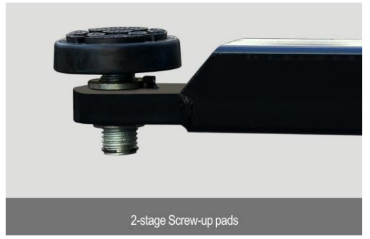
Screw adjustable pads